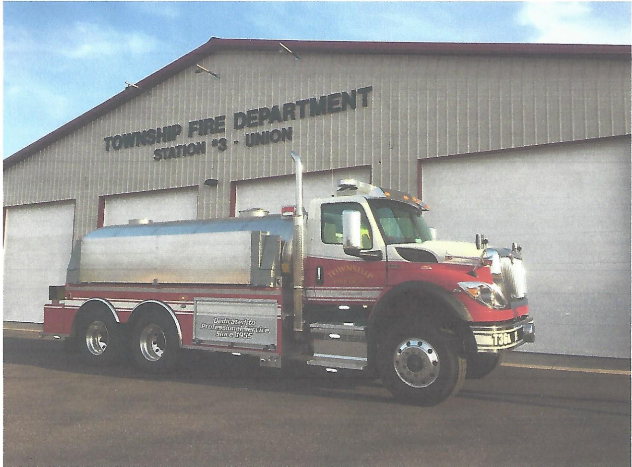
New Tender at Station 3