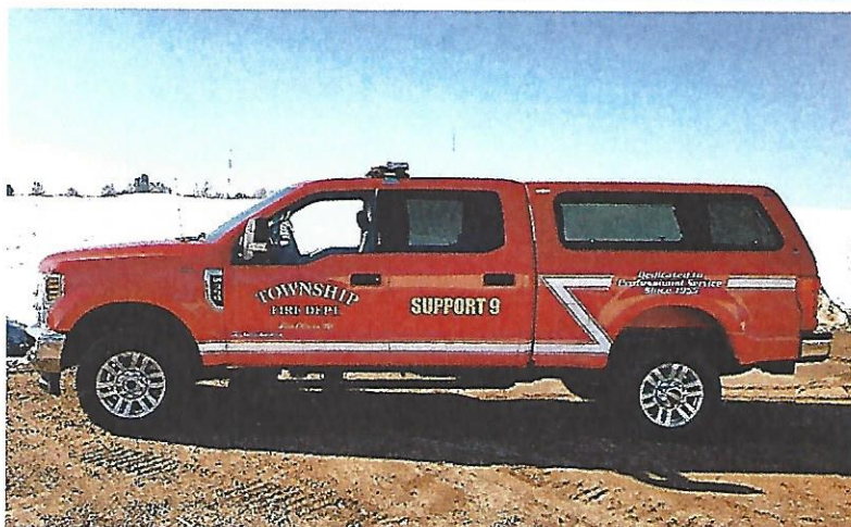
New Support 9