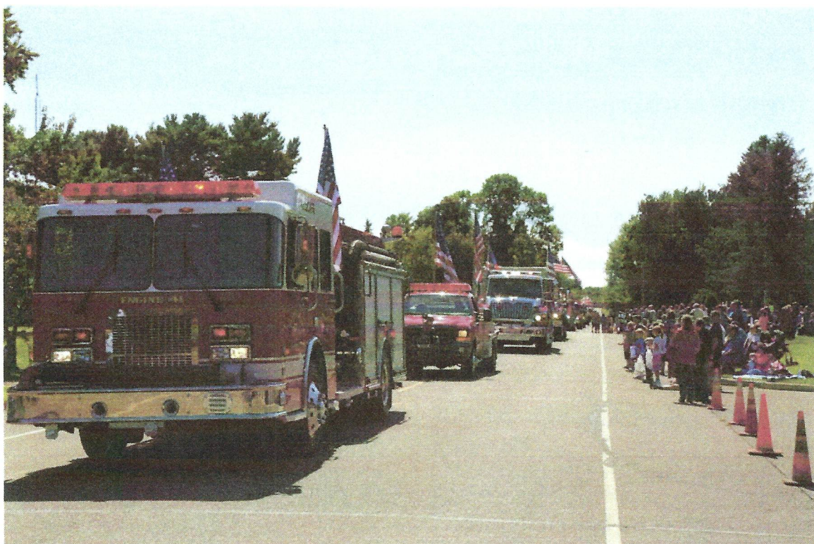
Harvest Festival Parade in Pleasant Valley

Proudly serving the Towns of Seymour, Washington, Union, Pleasant Valley and Brunswick in Eau Claire County