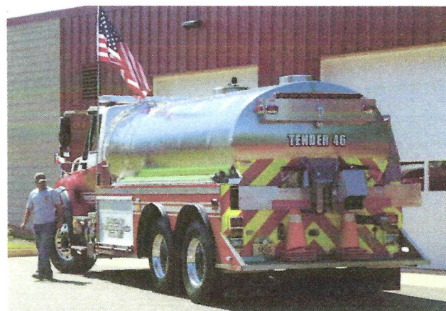
New Tender in Pleasant Valley