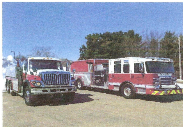
New Tender and Engine in Washington